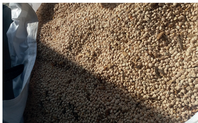
Lupinus albus grains.