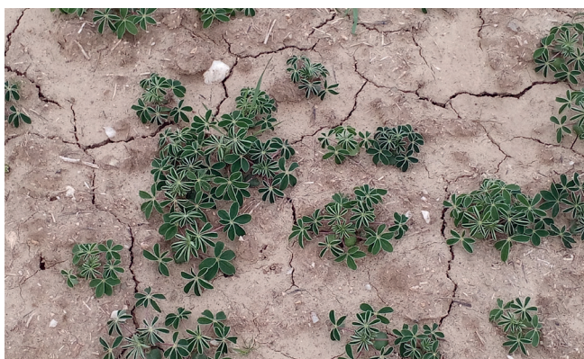
Young white lupin.

Sensors in each field collected data on air temperature, wind, rainfall, external humidity, soil moisture, etc. The Drill and Drop type and Enviroscan type ground sensors measured soil moisture in different depths e.g., 10 cm, 20 cm, etc. Data are easily accessible via a web application where farmers see the parameters of interest and act accordingly. These sensors cover a large area, thus providing data for several fields minimising the cost of use.