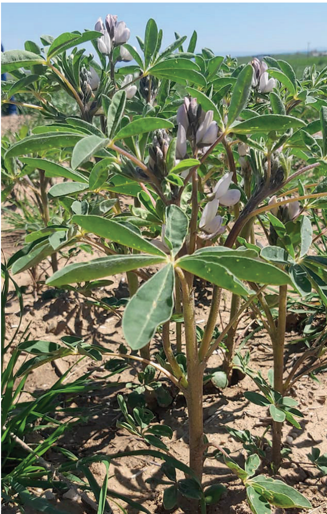
Maturing white lupin plant.

White lupin ( Lupinus albus ) is a good source of protein for animal feed and stands out as an alternative to soybean in the local market. However, the cultivation of the crop has declined in Greece mostly due to farmers opting for more profitable crops with better yields. The warm and dry climate in Greece leads to a drought impacting on lupin cultivation. This is the main agronomic risk. Precision irrigation combined with the good adaptation of domestic cultivars to local conditions can increase yields, thus revitalising lupin production. We conducted an experiment using a precision irrigation system to achieve the optimum yield and identify the irrigation needs based on field trial.